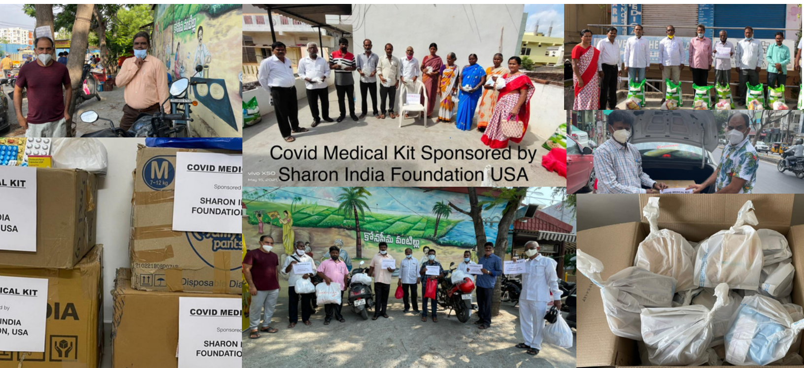
Covid Medical Kit Sponsored by Sharon India Foundation USA

PHASE 1 , THROUGH THE GENEROUS GIFTS OF YOU, OUR FRIENDS, WE WERE ABLE TO DISTRIBUTE 200 MEDICAL KITS TO AID OUR PASTORS NETWORK OF CHURCHES.